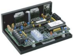
OFS350-DRI Open-Frame Stepper Drive

The OFS350-DRI is a microstepping driver that is operated with an external step and direction controller. A power supply, step motor, and step and direction controller are required in addition to the OFS350-DRI. These system elements are shown below.